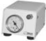
1422A Bench Mount