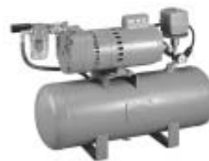
8140B-30/8170B-30 Tank Mounted Pump